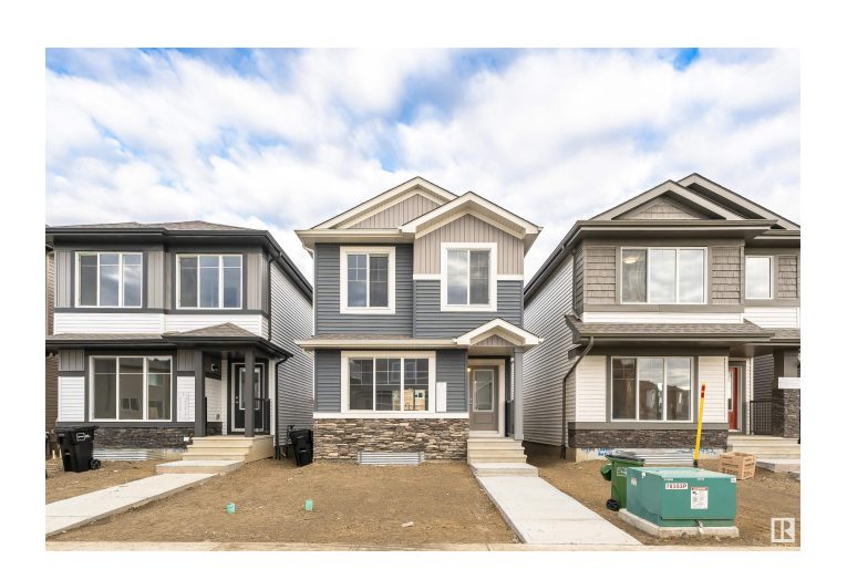
9566 Carson Bnd SW, Edmonton, AB