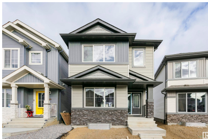
9530 Carson Bend SW, Edmonton, AB

Main Floor Exterior Area 74.32 m 2 Interior Area 68.37 m 2